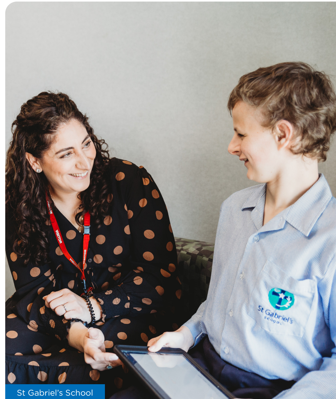
St Gabriel's School

While schools each have different starting points, engaging in a robust and effective improvement process over a sustained period of time can enable each school to create the necessary conditions to foster better academic and wellbeing outcomes for each and every student.