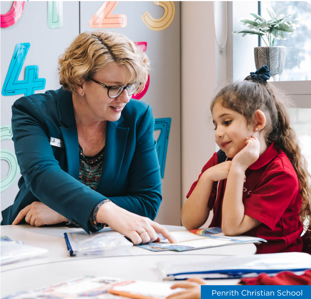
Penrith Christian School

A robust school improvement procedure with strong leadership catering for school context can embed effective practices and lift outcomes in a sustained way.