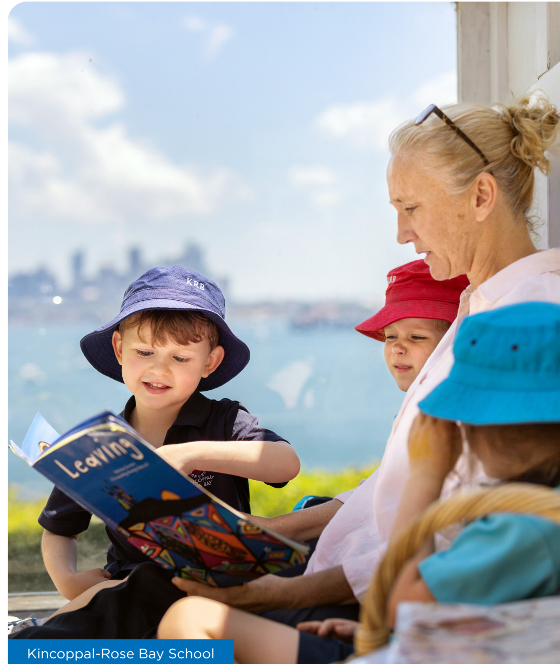
Kincoppal-Rose Bay School

Building active communities of practice and collaborative networks can support school improvement processes. It is through these professional learning communities (PLCs) that members learn from each other, create synergies that might be impossible in isolation, extend their organisational base and community support, and replenish their social and intellectual capital (OECD, 2013). In PLCs, members focus on student learning, work collaboratively and hold themselves accountable for results (DuFour & DuFour, 2013). Strong PLCs reportedly cultivate collective responsibility and collaborative cultures where people care for each other as individuals and commit to the shared vision of the organisation (Kools & Stolls, 2016).